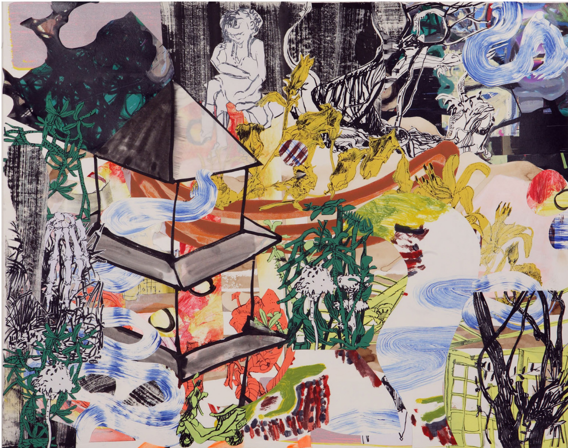
Elisabeth Condon, Figment 9, 2009, 22.5 x 37.5 inches

EC: When I returned from my first solo exhibition in Beijing in 2009, I became obsessed with collage and made a series of fourteen works that put ideas into motion, such as thinly layered spaces bumping up against each other and using imagery as gesture, like abstraction. This approach upended my sense of gravity and opened my work to a new way of seeing, suspended without a horizon line.