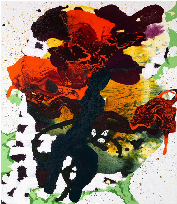
Elisabeth Condon, Checkers 2020, calligraphy and dispersion inks and acrylic on linen 30 x 21 inches / 76.2 x 53.34 cm