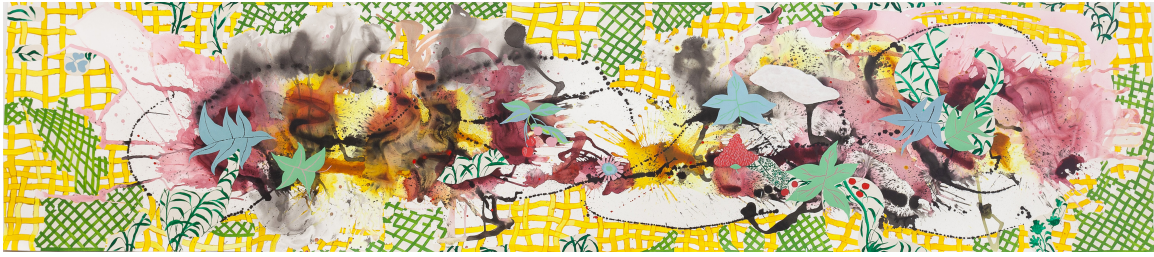
Elisabeth Condon, Lattice Dreams 2020, Calligraphy and dispersion inks and acrylic on Fabriano scroll, 55 x252 inches