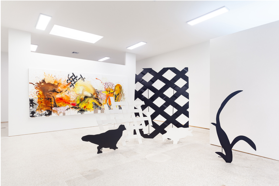
Elisabeth Condon, Effulgence , Installation View, 2019 Acrylic on linen panels, painted wood and metal structures, Emerson Dorsch Gallery, Miami